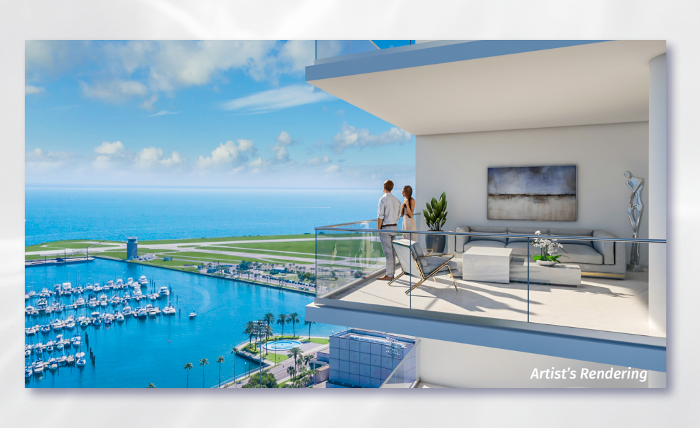
2<sup>ND</sup> STREET SOUTH